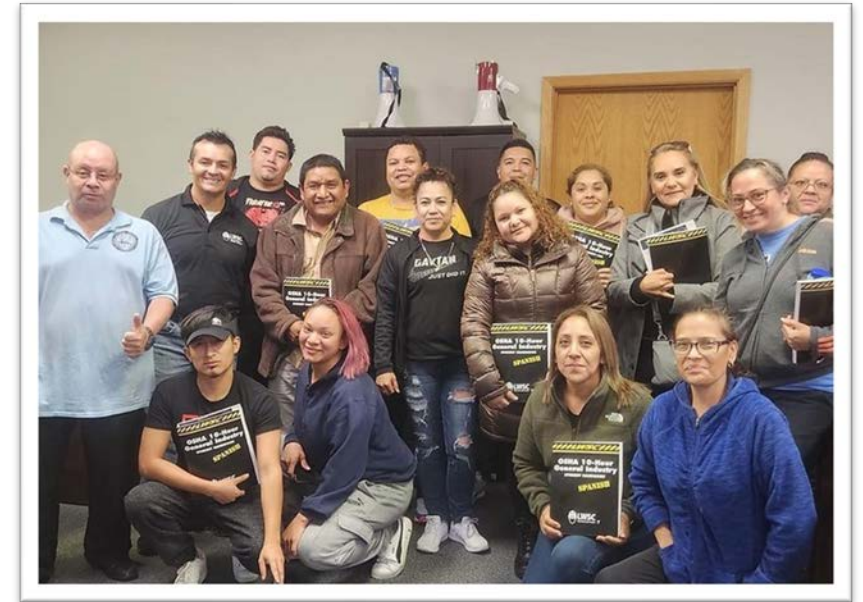
Chicago Workers Collaborative Website, 2/13/2023