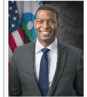
Michael S. Regan was sworn in as the 16th Administrator of EPA on March 11, 2021, becoming the first African American man and second person of color to lead the Agency.