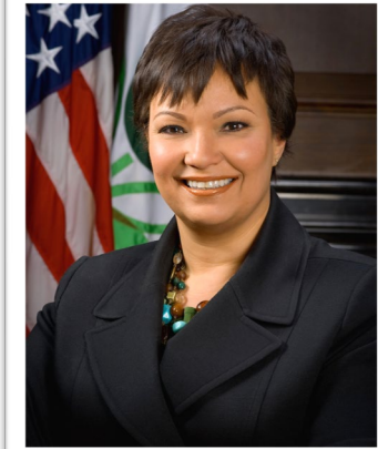
Lisa P. Jackson served as the 12th Administrator of EPA from 2009 to 2013. She was the first African American to hold this position.