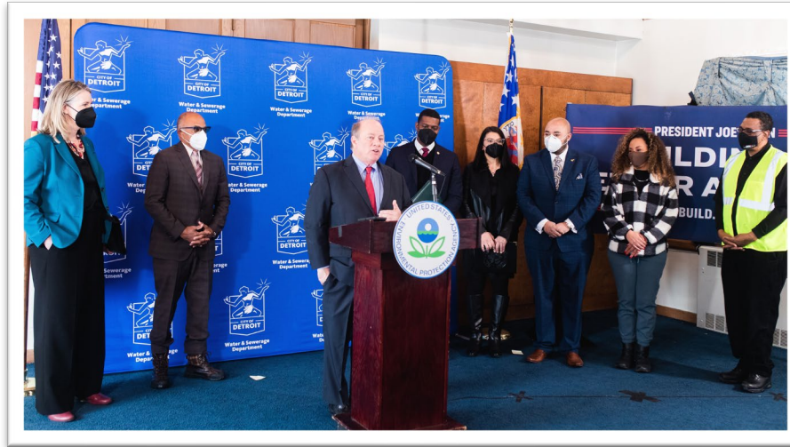
The City of Detroit hosted EPA Administrator Regan last February 2022 during a press conference on flood mitigation.