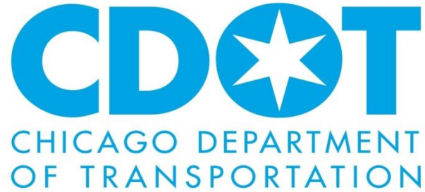
Image of the CDOT logo representing the of the project updates section.