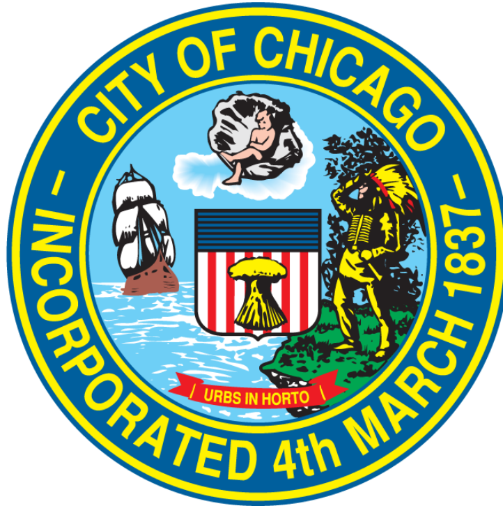
Image of City Seal representing the start of the City Updates section.