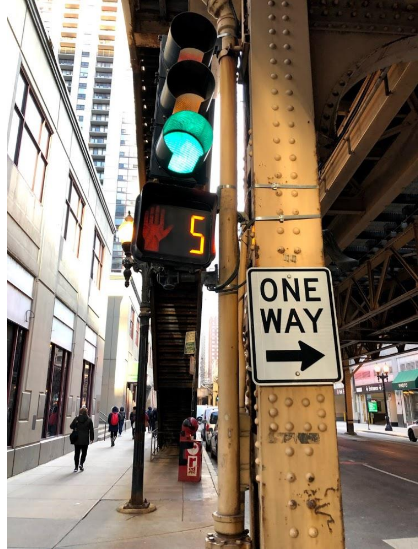
Photo of a pedestrian countdown timer under a traffic light taken in the Loop.