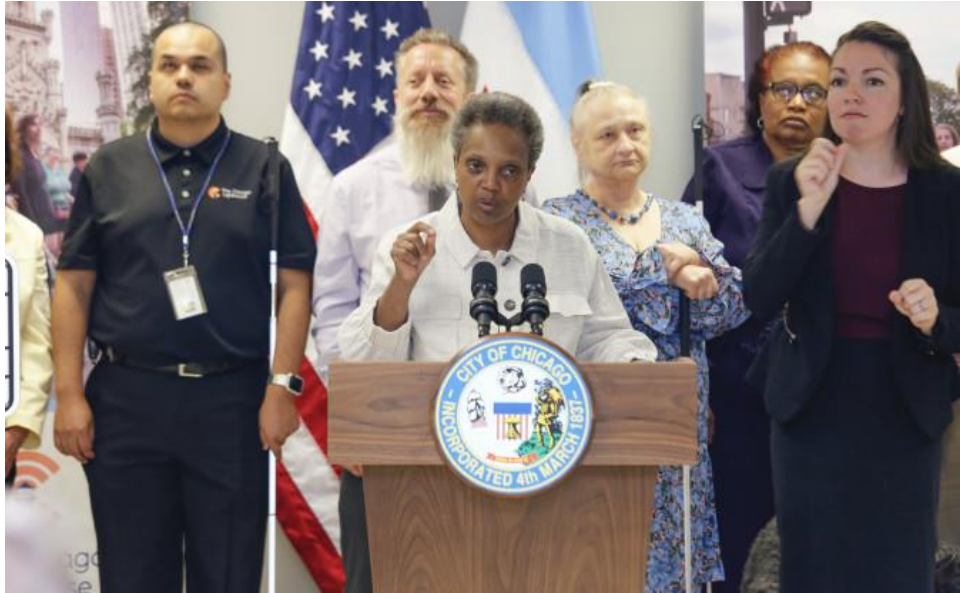
Photo of Mayor Lightfoot at podium at press conference announcing City's commitment to APS.