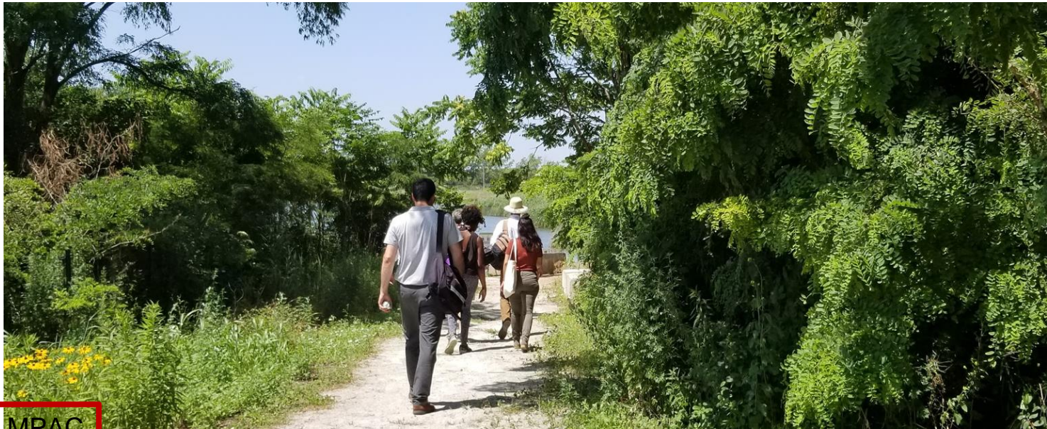
Photo of the MPAC site visit with the group walking away and backs turned away from the camera.